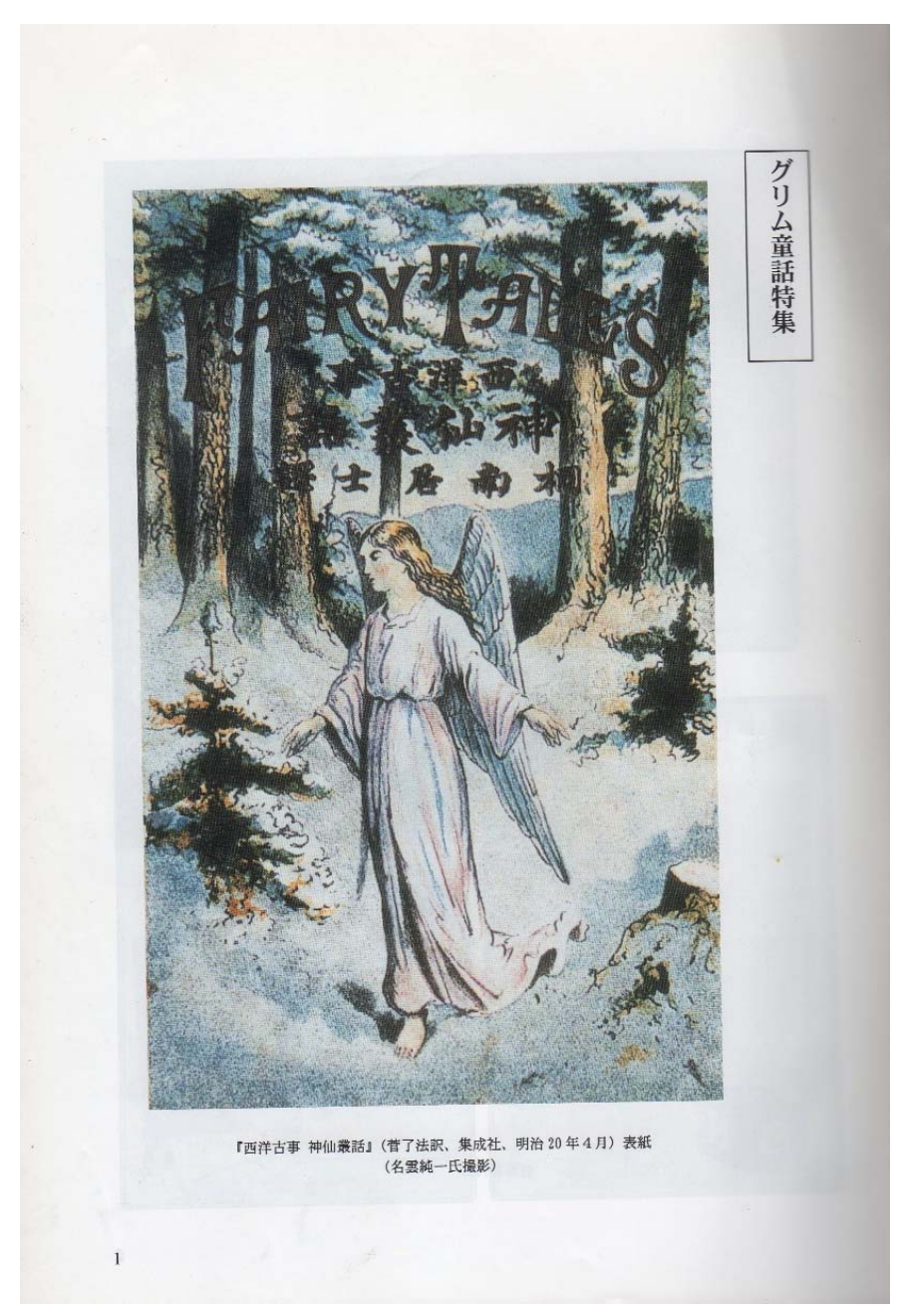
Front cover of Seiyo Koji Shinsen Sowa , by Ryoko Suga. Tokyo: Shusei sha 1887.